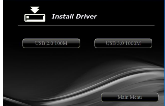
*Note: Actual image may vary

3. Follow the instructions on screen to install the driver.